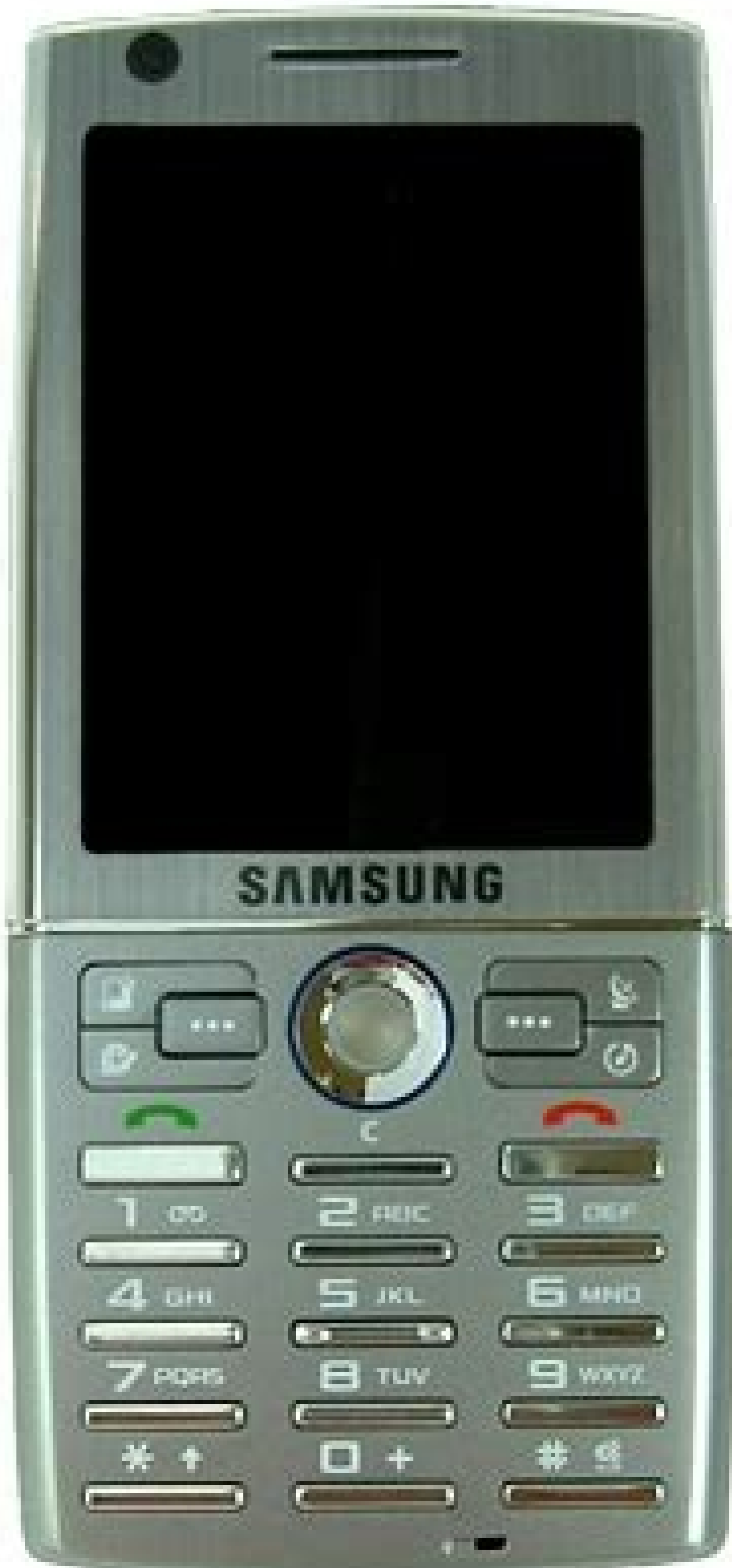
Are mobile phones radioactive. Does mobile has radiation. Does smartphones have radiation.